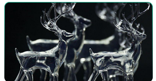
Clear UV Resin KS158T