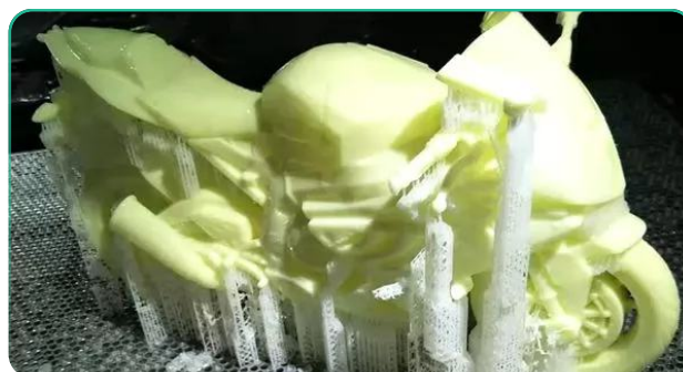
High toughness ABS Like Resin KS608C