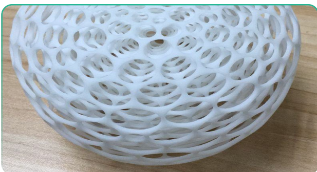
Durable ABS Like Resin KS408A