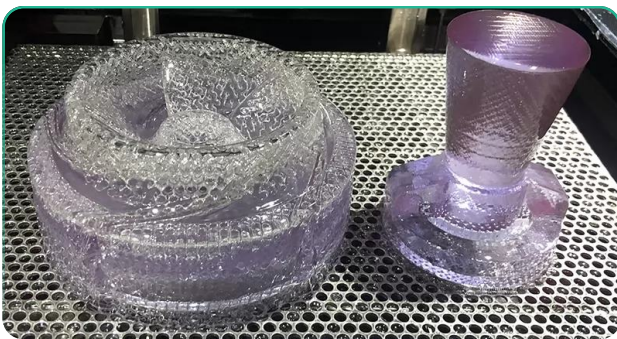
Clear SLA Resin UV Resin KS168C