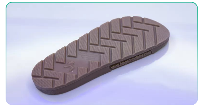
ABS Like SLA Resin KS908C