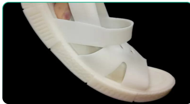
Rubber like UV Resin KS198S